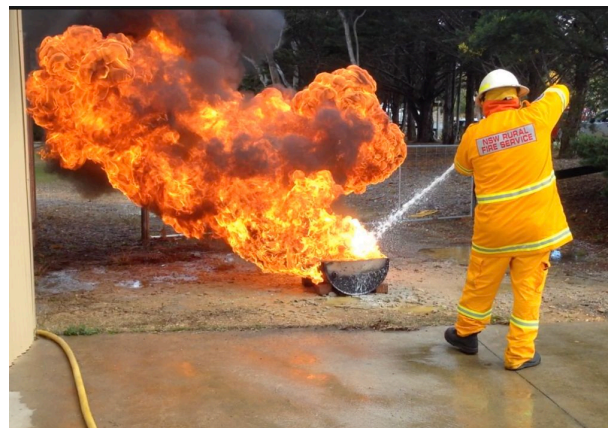
Fire Brigade action at the Open Day